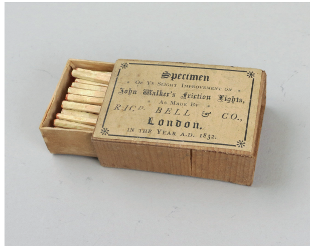
Figure 5: The “Friction Lights” match