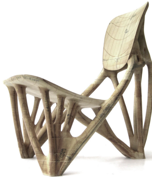
Figure 3: The paper bone chair